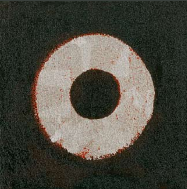
46cm x 46cm x 5cm