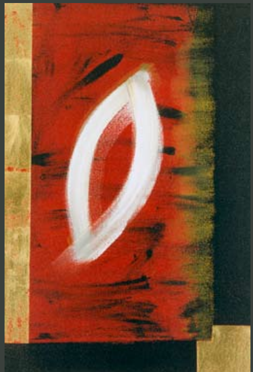
73cm x 50cm x 5cm