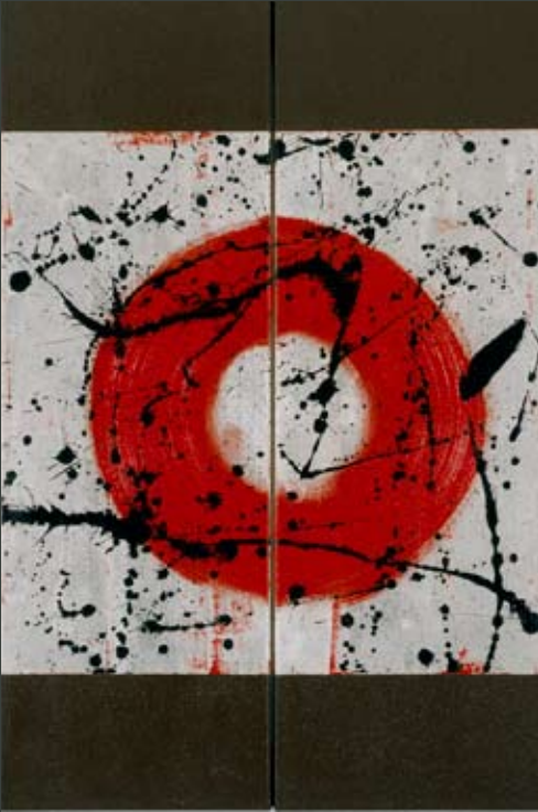
90cm x 30.5cm x 5cm