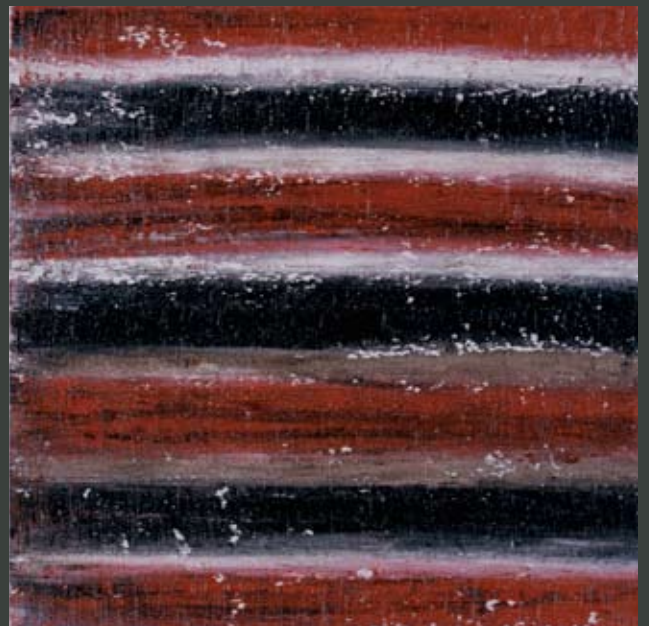
65cm x 65cm x 5cm