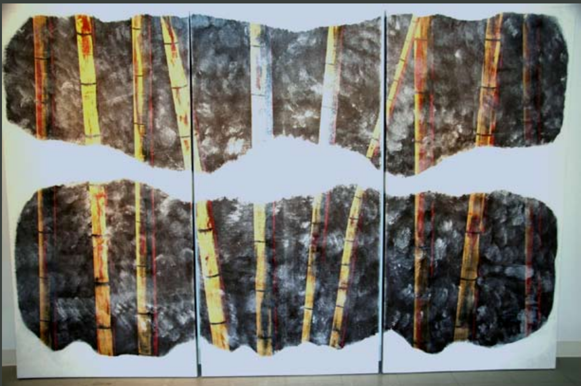
194cm x 97cm x 6cm x 3 canvases