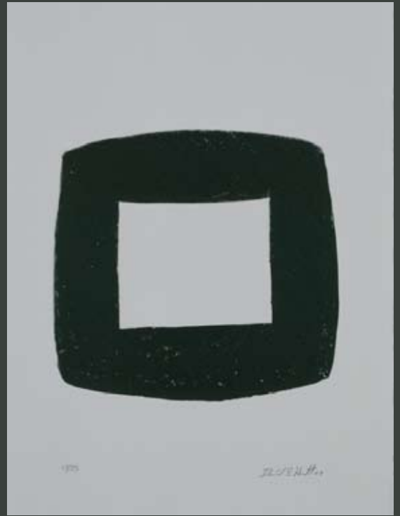
66cm x 50cm