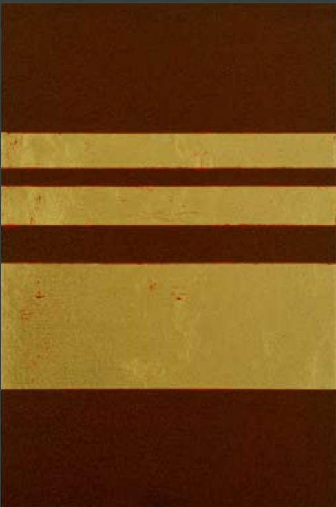
41cm x 27.5cm x 4cm