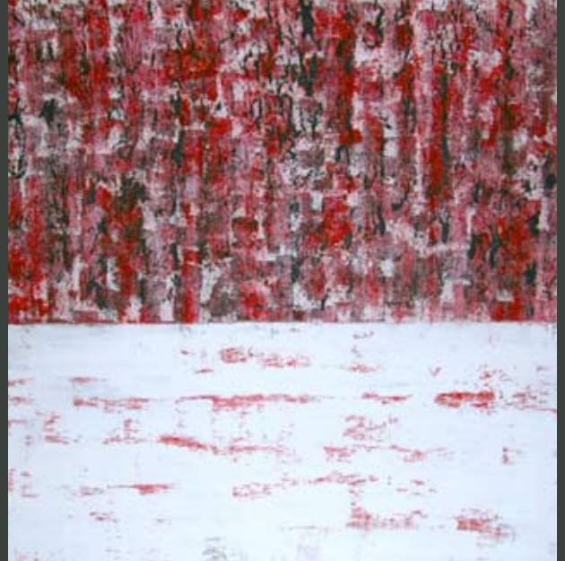
165cm x 165cm x 6cm