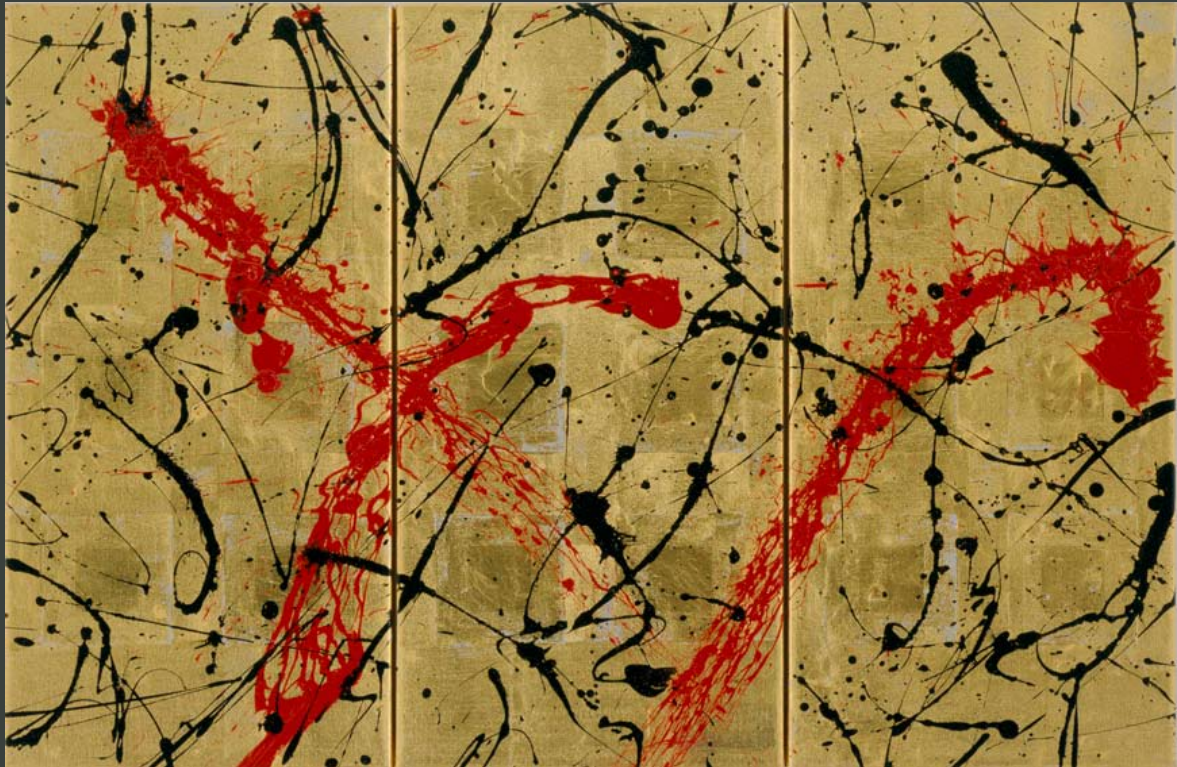
60cm x 30.5cm x 4cm x 3 canvases